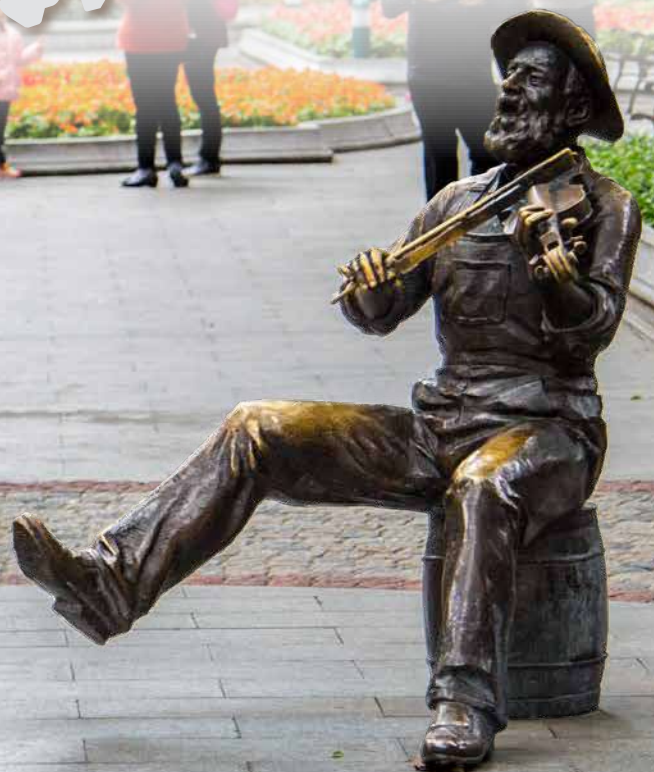
沙面岛 Shamian Island