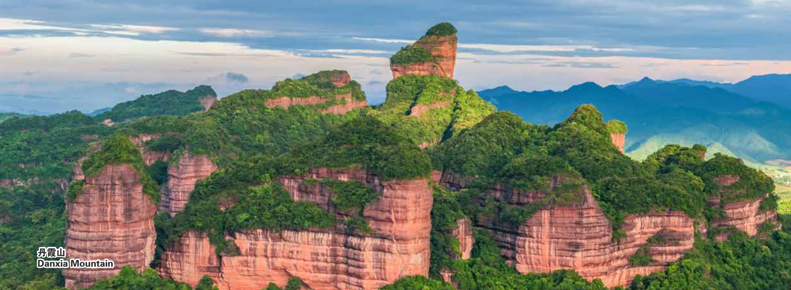
丹霞山 Danxia Mountain