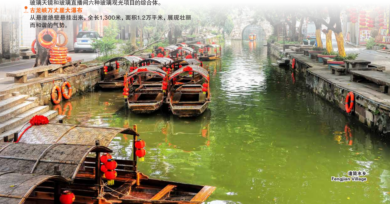
逢简水乡 Fengjian Village