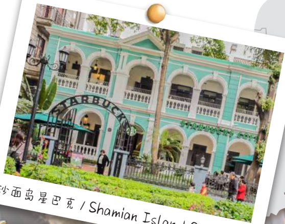
沙面岛星巴克 / Shamian Island Starbucks

Hanging from cliff edges, it spans 1,300 meters with an area of 12,000 square meters, showcasing majestic harmony.